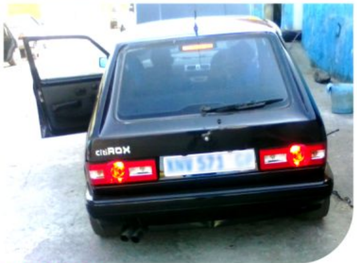
PROJECT: VW Citi Golf (CitiROX) Job Detail: Rebuild Rear Right Hand Quarter of Vehicle