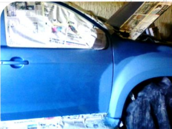
PROJECT: Isuzu KB 240 Double Cab Job Detail: Repair Front Right Fender, Replace Bumper and Full Body Paint