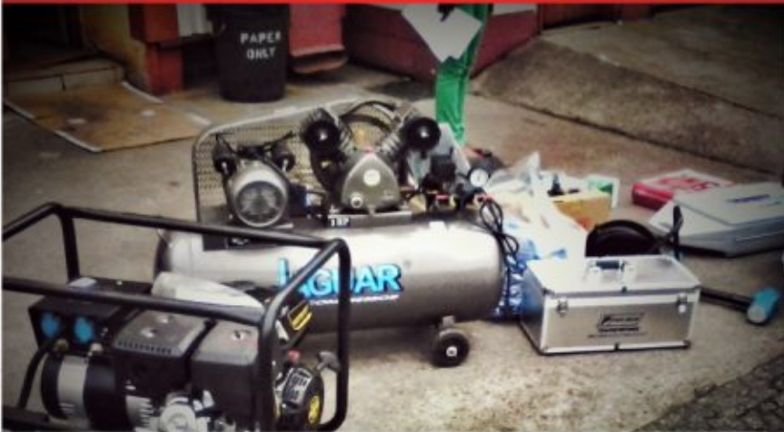
What We Work With: Jaguar 3HP Air Compressor, Hoffmann Power Weld Combo Generator, 4 Pound Hammer, 14 Pound Hammer, 3 Ton Chain Block